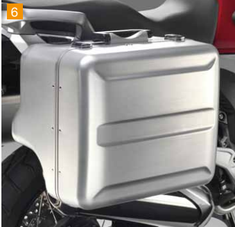
35L Pannier Kit (Alu) A set of two, direct fitting, Alu-look panniers designed to look fully integrated on the Crosstourer. The left pannier will hold most full-face helmets and they are lockable with the motorcycle key.