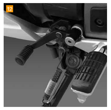
DCT Foot Shifter Kit A complete kit to select gears with a traditional foot shifter on the Crosstourer Dual Clutch Transmission model. Works in conjunction with, or in place of, the DCT handlebar shift triggers to offer a choice of gear selection styles.

U-Lock Keep your Crosstourer safe with this tamper-resistant barrel key U-Lock that fits neatly under the seat.