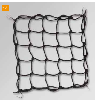
A black, flexible net to hold your luggage securely to the rear carrier and pillion seat.

A necessity for more secure parking on variable ground surfaces, a Mainstand also facilitates cleaning and rear wheel maintenance.