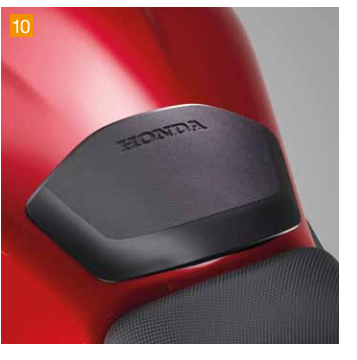
10 Tank Pad A black polyurethane Tank Pad that will help to protect the fuel tank from scratches.