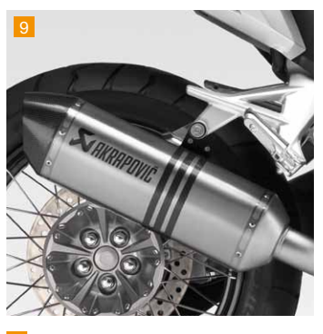
Titanium Slip-on Exhaust Delivering great looks and increased performance, this street legal Slip-on Exhaust conforms to all exhaust system noise level regulations for street use.

Carry your day to day necessities with this 21L black nylon bag with a silver Honda logo on the front. It fits into both the 29L Panniers or 39L Top Box and includes an adjustable shoulder strap and a carrying handle.