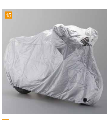
Outdoor Cover A water-resistant and breathable cover that allows the motorcycle to dry whilst covered, and protects the paintwork from UV rays. Supplied with an anti-flutter rope and two U-Lock holes. It can be used when Top Box and/or Panniers are fitted.