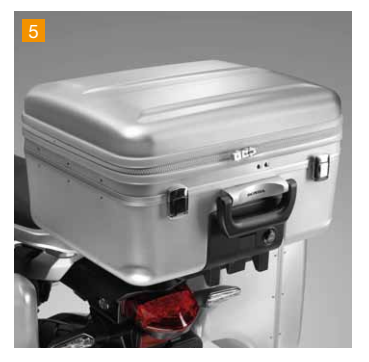
39L Top Box (Alu) An Alu-look Top Box offering 32L, expandable to 39L, of carrying capacity to store one full-face helmet and more. Featuring a quick-locking and easily detachable mounting system.