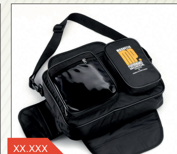
MAGNETIC TANK BAG 08L56-KAZ-800

Features approx. 13L carrying capacity and delivers convenient storage, will hold A4-size file (but not A4 binder). Includes rain cover.