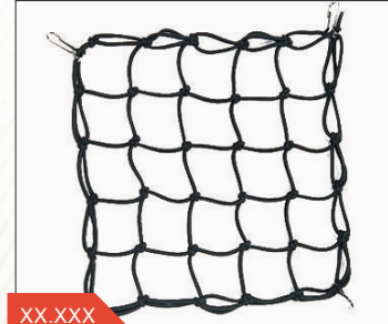
CARGO NET 08L63-KAZ-011

Black elasticated webbing for securing luggage on rear seat/rack.