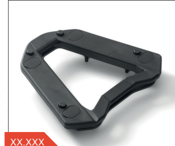
CARRIER BRACKET 31L 08L74-MJM-D10

Rear carrier base for use without top box. Floating system required for 31L top box.