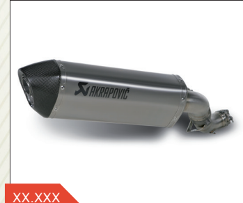
AKRAPOVIC SLIP ON 08F88-MJM-900

Titanium outer sleeve Akrapovic slip-on exhaust, street legal with E1 and TUV approval; can be used with panniers.