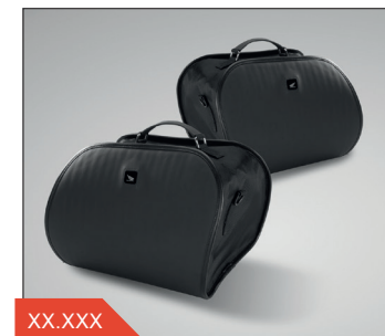
PANNIER INNER BAGS 08L56-MGE-800B

Set of two fashionable and carryable black pannier inner bags with black zippers and Honda Wing logo. 18L of carrying capacity with each, with handle and straps for carrying ease. Fits the 29L panniers perfectly.