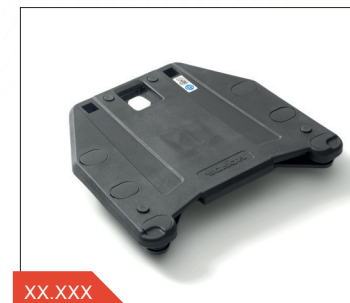
CARRIER BRACKET 45L 08L73-MGE-D40

Rear carrier base for use without top box. Floating system required for 45L top box.