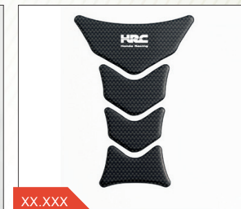
HRC TANK PAD 08P61-KAZ-800B

Protects rear and top of fuel tank, carbon-fibre print with HRC logo.