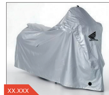
OUTDOOR COVER 08P34-MCH-000

Manufactured from water-resistant and breathable fabric, allowing bike to dry naturally while covered. Protects paint against damaging U.V. rays and features a securing rope plus access to fit U-lock. Can be used with top box and/or panniers fitted.