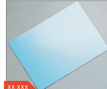
PROTECTIVE FILM 08P73-KBV-800

Protects paintwork from scratches; A4-sized, self-adhesive and cut to suit application.