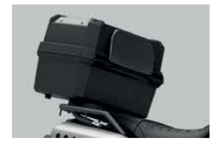
TOP BOX BACKREST

"Made of a sturdy and lightweight ballistic nylon, this 14 litre saddle bag enhances the tough appearance of the CL500. It can be attached / detached in aone step thanks to its three-point adapter sold separately. Equipped with a water-proof inner bag, easy to carry with its handle or its shoulder strap, this practical saddle bag is a must have for every day use. Allowable cargo load: 3.0 kg Required support 08L71-K3S-JAO solde separately."