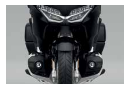
FRONT LED FOG LIGHTS