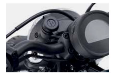
12V SOCKET 08U70-K2Y-A00

The meter visor improves the ride comfort by protecting the rider from adverse weather conditions and deflecting travelling air around the shoulders. Not compatible with the headlight cowl.