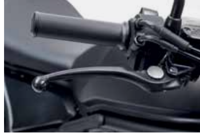
ADJUSTABLE BRAKE LEVER

The 12V socket can be neatly mounted beside the meter and thanks to its rubber cap, no unwanted objects can enter inside.