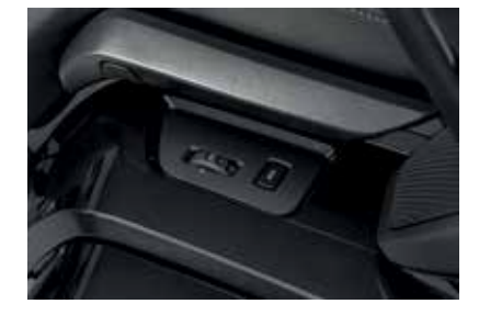
PASSENGER AUDIO SWITCH KIT 08A70-MKC-A00

Pair of 25-watt speakers expanding the audio system of a no-trunk version. The Rear Speakers are installed in the saddlebags of the Gold Wing.