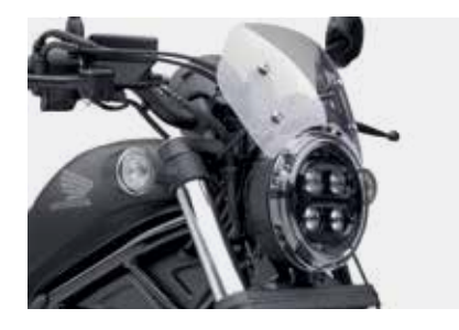
METER VISOR 08R74-K87-A30

The meter visor improves the ride comfort by protecting the rider from adverse weather conditions and deflecting travelling air around the shoulders. Not compatible with the headlight cowl.