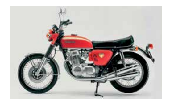
The Dream CB750 FOUR, which hit the market in July 1969

After 5 consecutive titles in the World Grand Prix Road Racing Series, Honda decided to withdraw and turn toward its primary target: transfer the technology obtained in competition to develop high-performance consumer machines. After a first attempt with a 450cc, Honda released the CB750 Four in January 1969. The initial production forecast of 1,500 units a year became soon a monthly figure and then jumped to 3,000 units/month. By pushing the boundaries of performance, reliability and easy handling in motorcycles, Honda created a new class of Superbikes. The CB1000R is the modern expression of the same spirit that guides Honda engineers since decades.