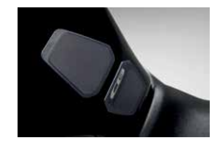
TANK PAD (CB LOGO)