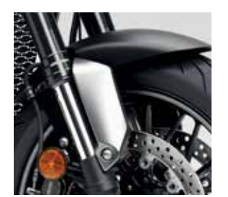
FRONT FENDER PANEL KIT

The Grip Ends give the CB1000R a sportier look while increasing the protection in case of fall.