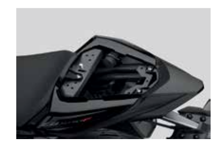
12V ACCESSORY SOCKET

Extremely slim heated grips which provide 360° heat around the grips. Features integrated control for maximum rider comfort and design integration. Features 3-step variable heating levels, integrated circuit to protect the battery from draining and smart heat allocation that focuses on the area of the hands most sensitive to cold. Attachment and special heat-resistant glue available included.