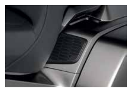
REAR SPEAKER KIT 08ESY-MKC-RR21